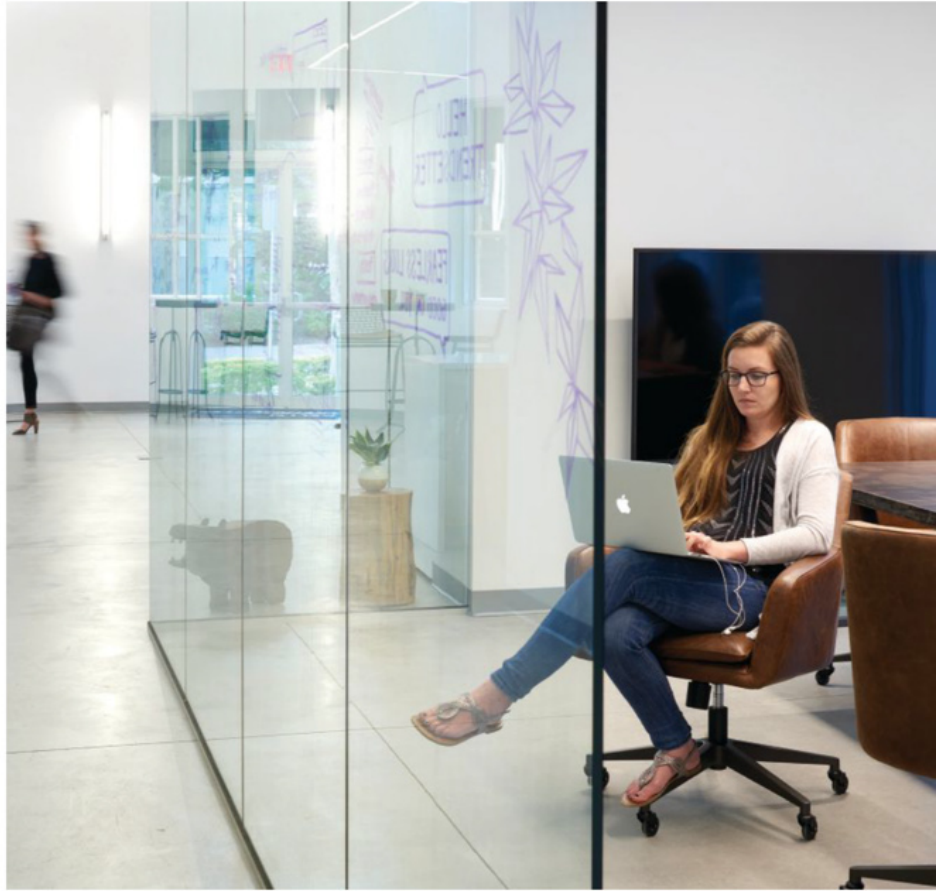
Top left: Sparxoo entryway Bottom left: Sparxoo staircase and rotunda. Right: The office space was constructed to facilitate employee movement throughout the work day.