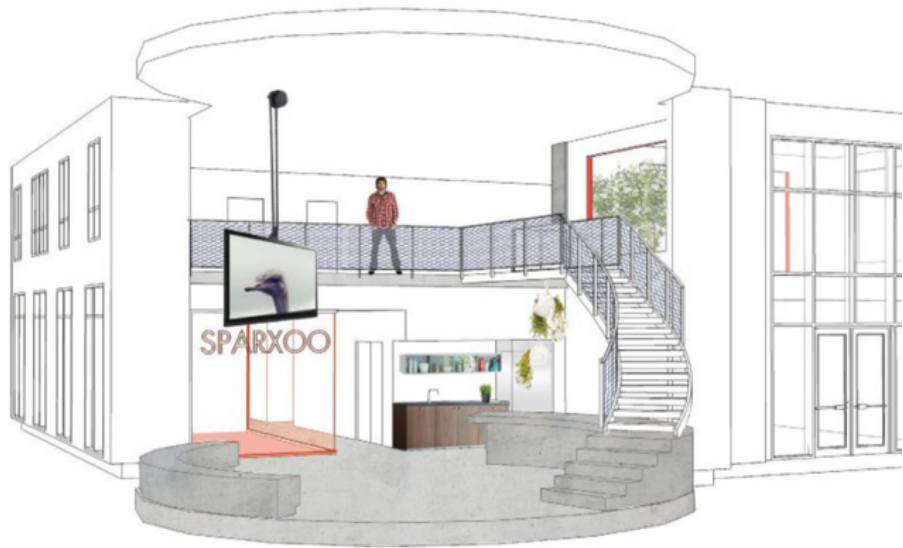
Above left: Encircled by windows, the rotunda's double height space visually connects the glass meeting rooms on the first floor with the open workspaces above via a staircase. Above right: Rendering of Sparxoo showing entryway