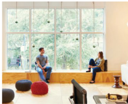
Top: Sparxoo entryway Above left: Plywood wrapped lounge Above right: Collaborative space