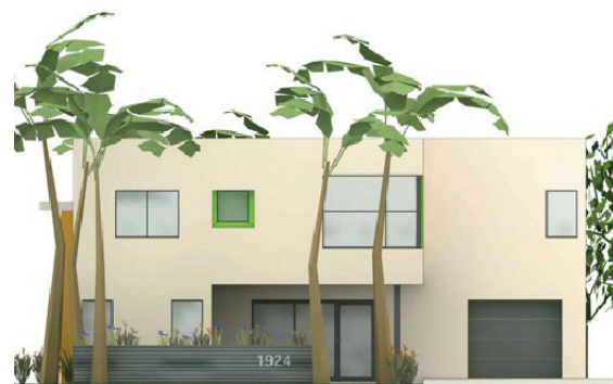
Elevation, Bougainvillea Residence, COURTESY OF TRACTION ARCHITECTURE