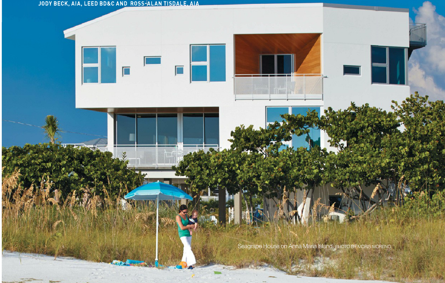
Seagrape House on Anna Maria Island.