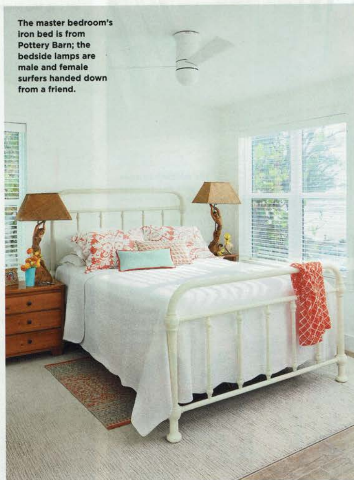
The master bedroom's iron bed is from Pottery Barn; the bedside lamps are male and female surfers handed down from a friend.