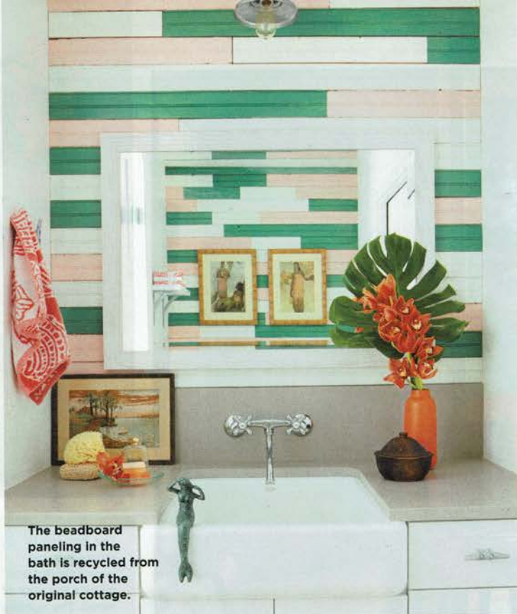
The beadboard paneling in the bath is recycled from the porch of the original cottage.