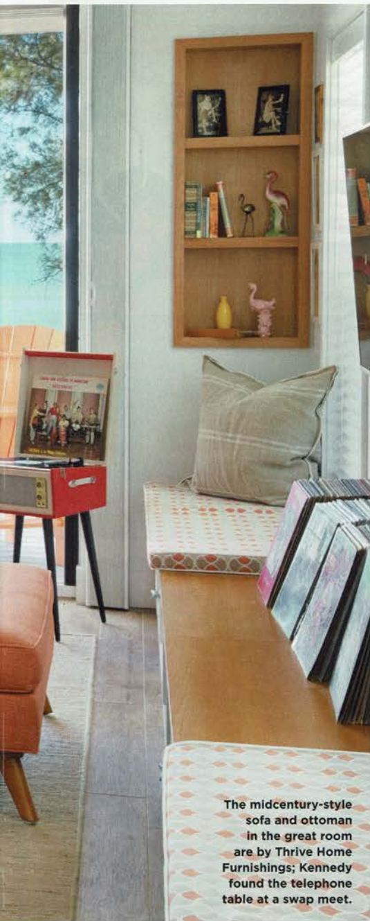
The mid-century-style sofa and ottoman in the great room are by Thrive Home Furnishings; Kennedy found the telephone table at a swap meet.