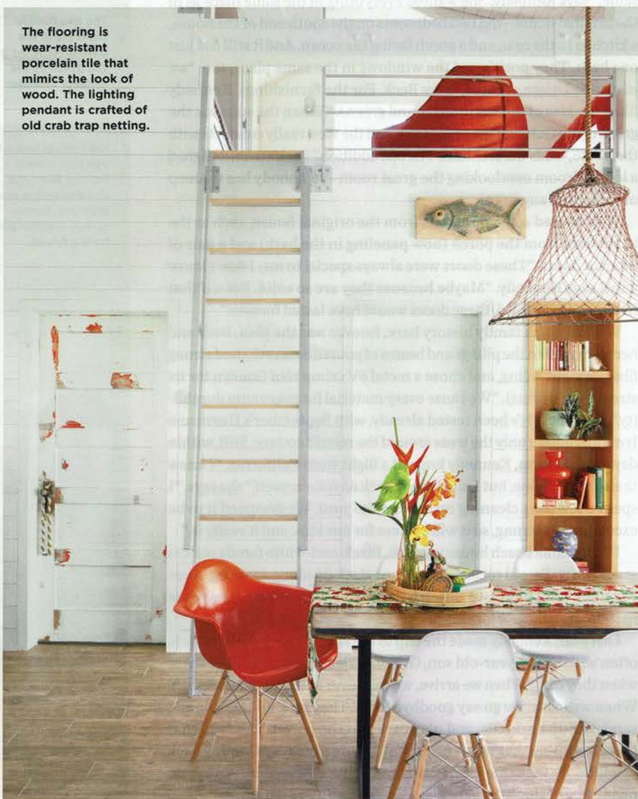
The flooring is wear-resistant porcelain tile that mimics the look of wood. The lighting pendant is crafted of old crab trap netting.